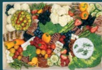
GRAZEY FOR KETO