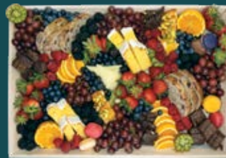
SWEET & GRAZEY